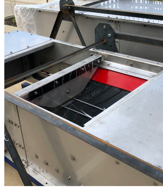
Powder Coated Components

This solution delivers increased productivity and unmatched durability for heavy industries.