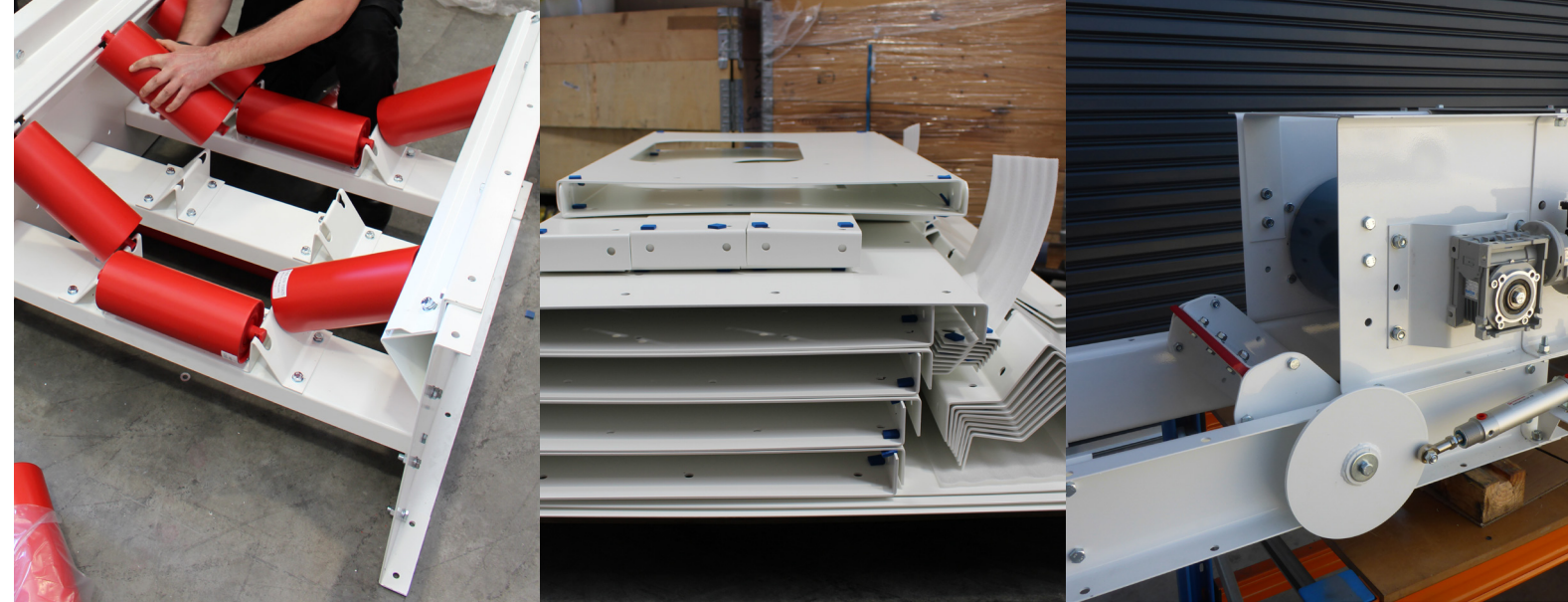
Quick & Easy Set-up

This solution delivers increased productivity and unmatched durability for heavy industries.